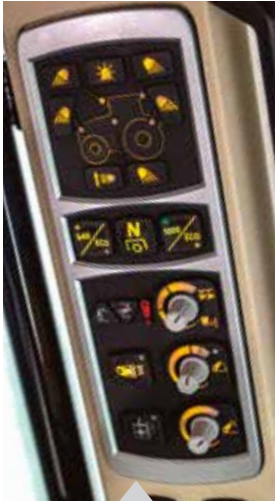
Pillar mounted PTO speed selection controls and linkage controls.