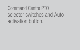
Command Centre PTO selector switches and Auto activation button.