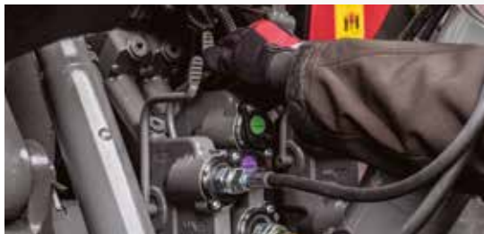
Conveniently located decompression levers