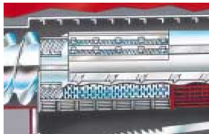
High performance shaker shoe: a grain pan under the rotor carries the crop to the front of the shaker shoe