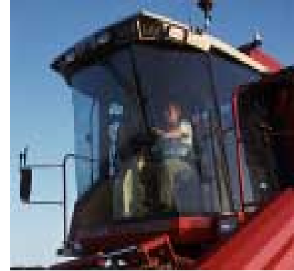
At night, 8 work lights ensure perfect visibility

The multi-function lever mounted in the arm rest of the seat controls the operation of the standard hydrostatic transmission and table functions.