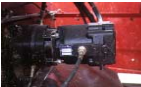
Hydrostatic rotor drive: for reliability with Constant rotor speed for maximum harvesting capacity