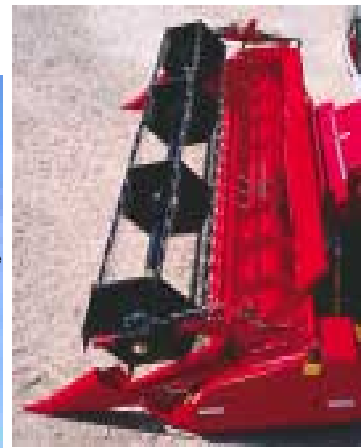
Freeflow table: design details that already make all the difference