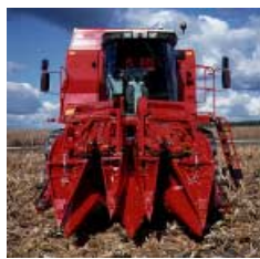
Maize harvesting: The 8780 is in its element. High output, together with a clean and high quality grain sample are the three main qualities of this machine