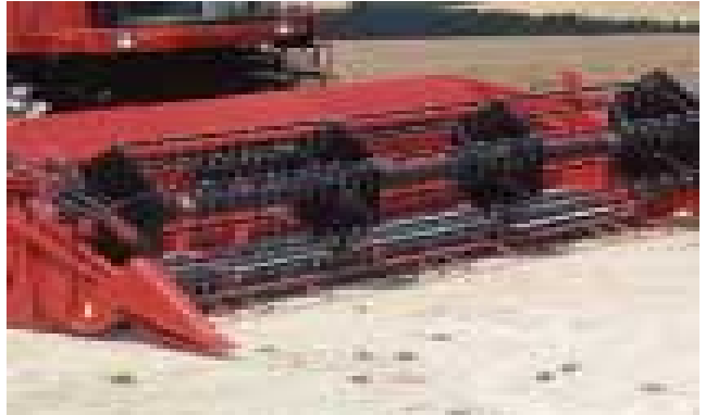
Powerflow table: well-proven performance

Hydrostatic reel drive with automatic reel speed control matches the forward speed of the combine and thus improves feeding – a major benefit to even the most experienced operator.